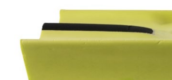
Waterfall front edge